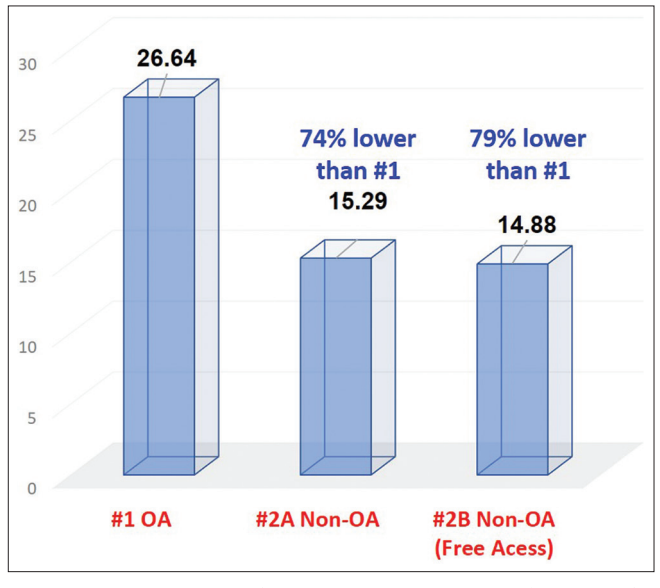
Figure 2: Comparison of average citation per article (CPA) for open-access (OA) and non-OA publications (P<0.05) [Table 2]. The average CPA for OA publications was 26.64. This was 11.35 higher than the average CPA of non-OA conventional publications with subscription (category #2A) (74% increase over15.29). It was 11.76 higher than the average CPA for non-OA conventional publications with free access (category #2B) (79% increase over 14.88).

Comparable data could not be evaluated from public data for non-OA articles (with or without free access). Dwlds: Downloads, J of cytology: Journal of cytology, OA: Open access