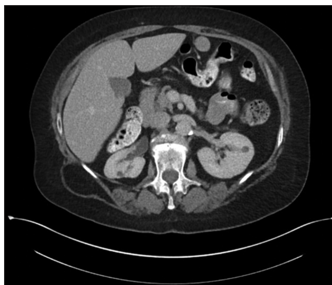
Figure 1: Computed tomography (CT) abdomen showing small renal mass involving left kidney.

The patient is currently under active surveillance. A follow-up CT scan of the abdomen showed stable tumor size after 6 months of initial diagnosis.