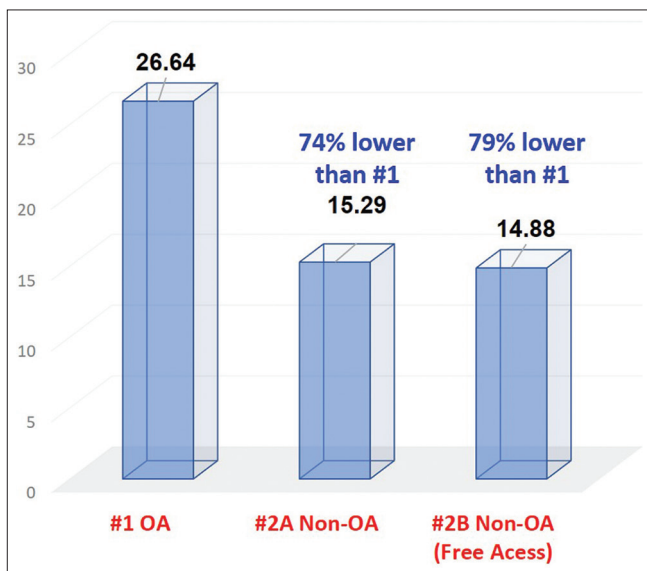
Figure 2: Comparison of average citation per article (CPA) for open-access (OA) and non-OA publications ( P < 0.05 ) [Table 2]. The average CPA for OA publications was 26.64. This was 11.35 higher than the average CPA of non-OA conventional publications with subscription (category #2A) (74% increase over 15.29). It was 11.76 higher than the average CPA for non-OA conventional publications with free access (category #2B) (79% increase over 14.88).

with increase in OA publications and overall impact of OA in scientific literature. [12,13] Top publishers, governing agencies, as well as major scientific communities continue to advocate OA platform. [14]