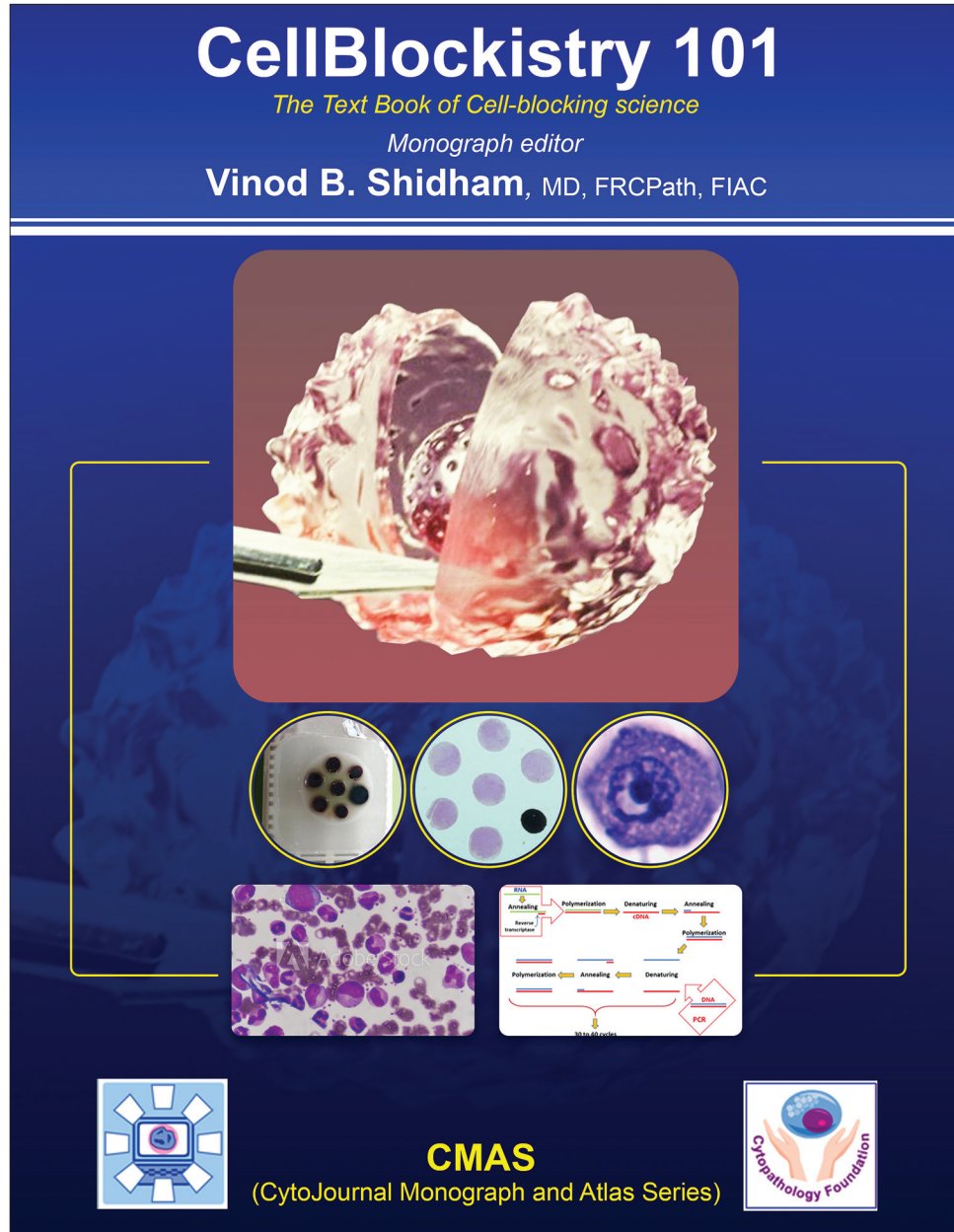
Figure 1b: Cover page of the first CMAS (CytoJournal Monograph and Atlas Series): CellBlockistry 101 ( Text Book of Cell-blocking science ).

This CMAS volume will also serve as a template for future monographs in pipeline.